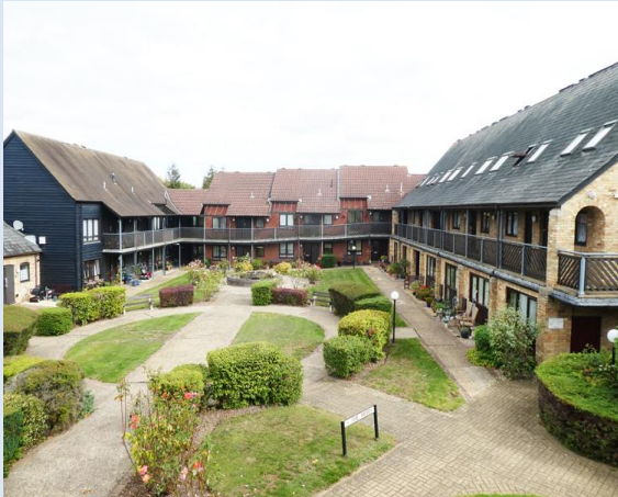
View of Courtyard